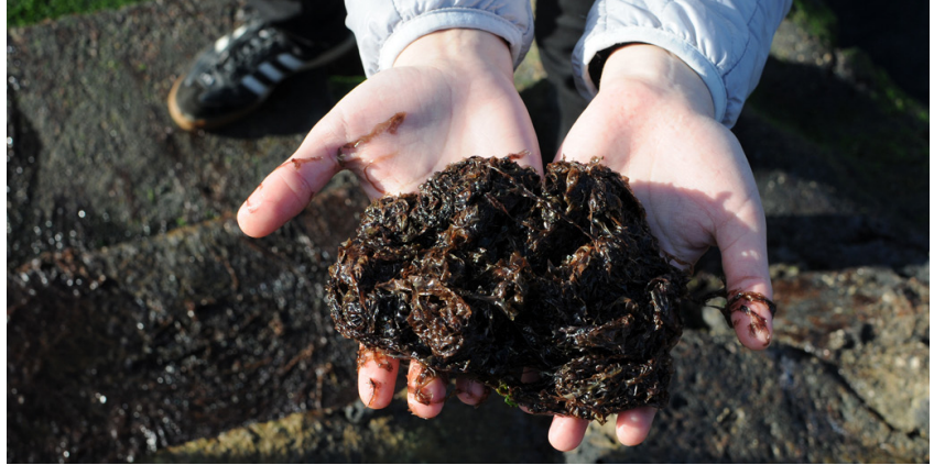
Figure 2 Top: Edible Aroids in the Western World; Bottom: Edible Aroids in the (Sub) Tropics © Grahame Jackson, INEA

First one has to carefully wash the seaweed. And even though today one could use tap water traditionally one would use seawater, a method that will help preserve the original flavor. After, the seaweed is carefully washed and all rocky particles and sand are removed one has to carefully cut the seaweed. After the seaweed is chopped, we add the garlic and malagueta pepper paste, a local and mildly hot staple ingredient. At this point, Elisabete and her mother explain that there are two traditional recipes; one is simply fried using corn flour. For the other recipe, we have to incorporate an egg or two (depending on the number of people) and gently form the patties, later frying them one by one.